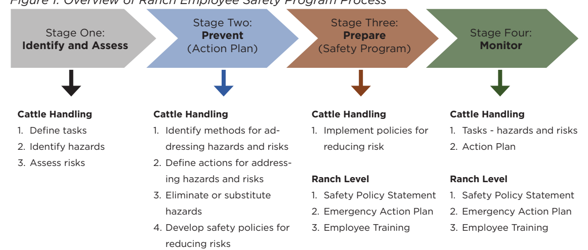
Figure 1. Overview of Ranch Employee Safety Program Process

<sup>1</sup> https://www.bls.gov/news/release/cfoi.t03.htm